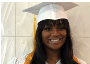
YOUTH FOSTERING CHANGE